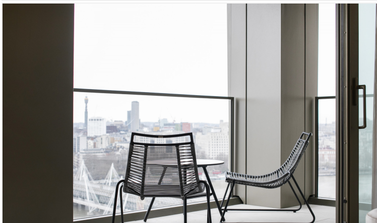
Belveder Gardens 16th floor

Views overlooking Jubilee Gardens & River Thames